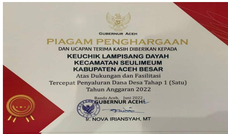
Figure 1. Lampisang Dayah Village Certificate of Appreciation

Governor of Aceh for being the fastest village in distributing village funds.